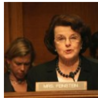
Senate Judiciary Committee