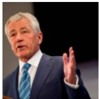
Hagel urged to move on 'game-