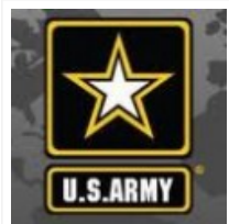
Army network modernization